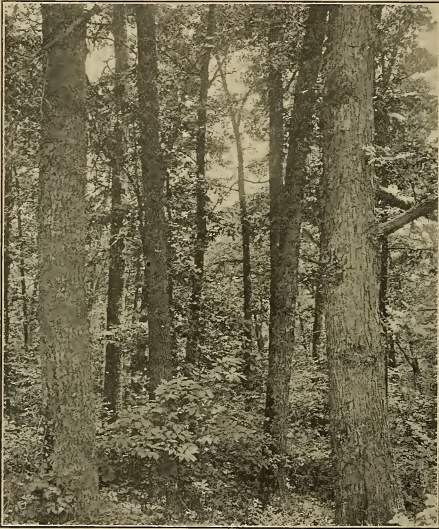
FIG. 3. An oak-hickory forest of a very mesophytic type; Salisbury. The tree in the right foreground is Quercus alba ; most of the others are Quercus rubra . The undergrowth includes many of the shrubs listed on page 177. A majority of the young trees are Castanea dentata (i. e., in center foreground) and Acer saccharum .

is well brought out in fig. 3. Underneath the canopy formed by the larger trees there usually develop certain smaller arborescent species, viz., Cornus florida , Ostrya virginiana , and Sassafras variifolium . The rest of the undergrowth, with the exception of some few species like the huckleberry and the blueberries, which